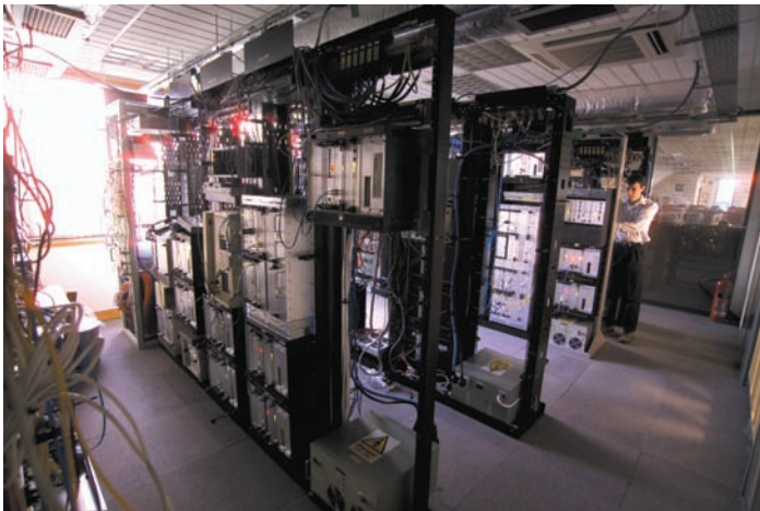
MetaSwitch's Interoperability Labs

MetaSwitch has extensive experience in deploying multi-vendor networks, and has established one of the most comprehensive interoperability programs in the industry. Literally hundreds of devices from dozens of technology companies have been successfully tested with the MetaSwitch Class 4/5 softswitch solution.